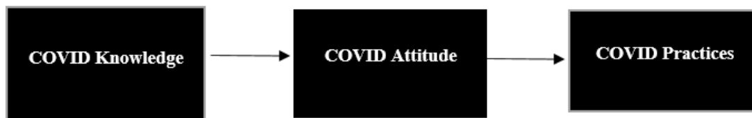
Figure 1: Theoretical Framework

In 1960, KAP (Knowledge, Attitude and Practice) theory was developed by Western scholars to study health behaviour changes. The theory proposed that human behaviour encompasses three succeeding processes: first to acquire knowledge, second to generate attitudes and third to form behaviours (Ross & Smith, 1969). In light of KAP theory, the spread of COVID-19 would certainly be affected by the behavioural practices of the individuals, which are preceded by the existed knowledge and information pertinent to action.